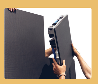
Easy assembly for quick and simple installation.