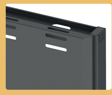
Vented rear and top sections allow for airflow to and from tiles.