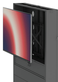
Built-in Accession™ mount provides efficient and simple access to behind-screen devices and cabling.