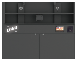
Custom cut-outs on infill panel allow for touch panels, branding & more.