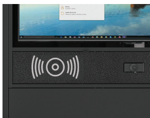
Custom VC panel options include fabric-wrapping for discrete speaker display.