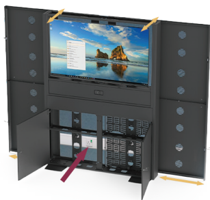
Fully install from the front with secure sliding back panels that offer access to wall-based connectivity.