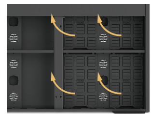
4x removable AV trays offer simple maintenance and can be pre-populated.