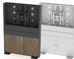
Custom frame and panel colour options to suit corporate guidelines.